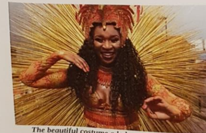
The beautiful costume a lady.