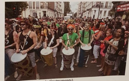
People play music (instruments).